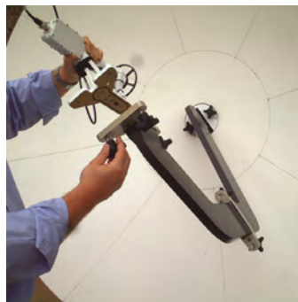
Quick Release Feed