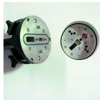
Quad-band Feed arms – C/X, Ku & Ka (C/X, Ku/DBS & Ka available as an option)